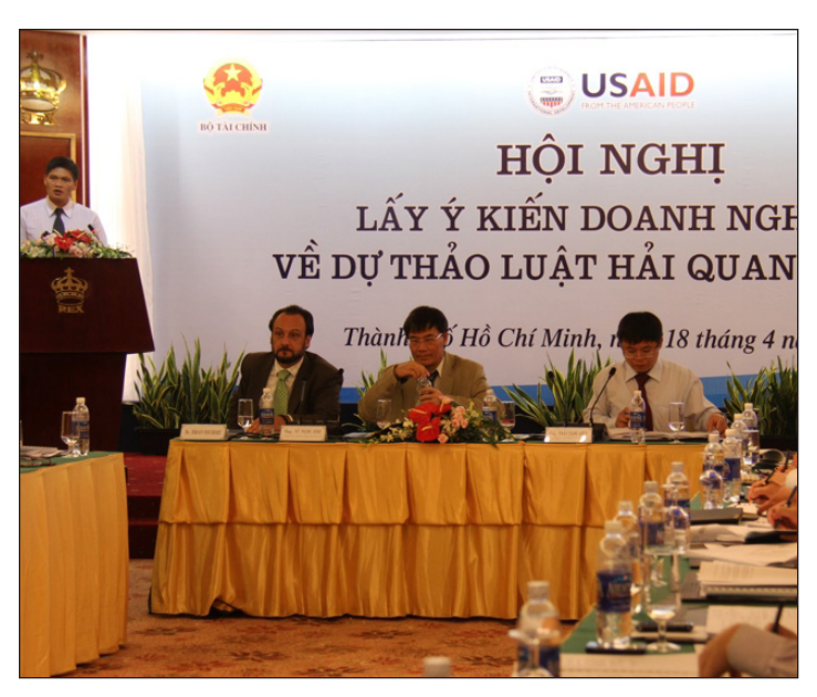
Vietnam Customs held two consultation workshops in Hanoi and Ho Chi Minh City, sponsored by the ASW Project, to elicit feedback on the draft Customs Law.

To support Vietnam's modernization of customs operations the project commented on the compatibility of the draft customs law with the Revised Kyoto Convention and the WCO SAFE Framework. The project also sponsored two public-private consultations workshops to elicit feedback on the new draft law.