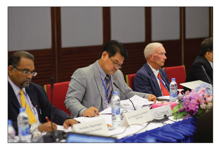
Nathan Associates legal advisers support ASEAN in drafting a regional legal framework for electronic single window connectivity.

At the countries' request the project helped draft legal instruments in Lao PDR and Thailand that formally established their national single windows (pending passage). In Lao PDR, the project reviewed and commented on the draft e-transactions law, which was promulgated by the President of the Republic, with support from the ADVANCE LUNA Project.