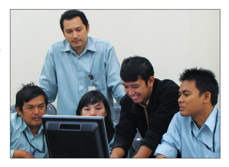
Indonesian Ministry of Trade officials receive hands-on training in installing and using the Certificate of Origin software application.

After developing software to process and exchange the intra-ASEAN certificate of origin (ATIGA Form D), the project conducted a train-the-trainers program for the Indonesian Ministry of Trade. The software was installed and used in more than 70 government offices that process certificate-of-origin applications and share certificate data with ministry headquarters. Indonesia has since customized the software to expand its capabilities.