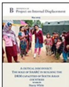
A Critical Disconnect: The Role of SAARC in Building the DRM Capacities of South Asian Countries