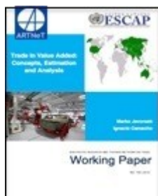
Trade in Value Added: Concepts, Estimation and Analysis