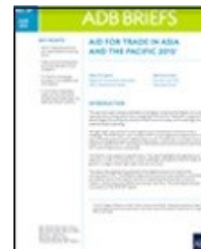
Aid for Trade in Asia and the Pacific 2015