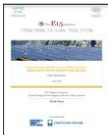
Clean Energy and Access to Infrastructure: Implications for the Global Trade System