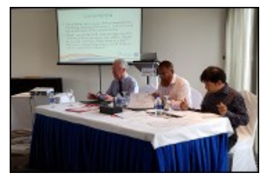
AgendaRevised Kyoto Convention

The Nepal Ministry of Commerce and Supplies held a National Validation Workshop to present to stakeholders preliminary results and findings from studies conducted under the Trade and Transport Facilitation Monitoring Mechanism (TTFMM). The Workshop reviewed trade processes along 3 key trade routes, and discussed key TTFMM methodologies – business process analysis, time release studies, and time-cost-distance. Read More >>