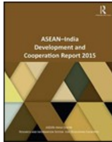
ASEAN-India Development and Cooperation Report 2015