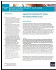
Asian Development Outlook 2015 Supplement: Growth Holds Its Own In Developing Asia