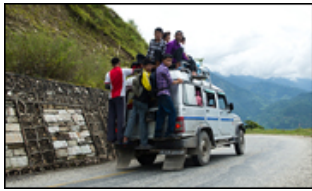
PROJECT ADB APPROVES SASEC ROADS IMPROVEMENT PROJECT IN NEPAL