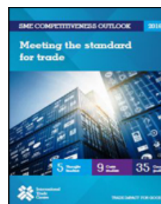
SME Competitiveness Outlook: Meeting the Standard for Trade