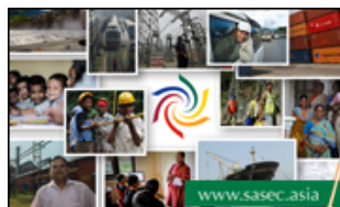
SASEC WEBSITE BROCHURE