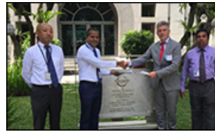
PROJECT FIRM TO DEVELOP SRI LANKA PORTS MASTER PLAN