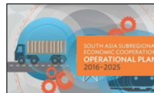
SASEC OPERATIONAL PLAN 2016-2025