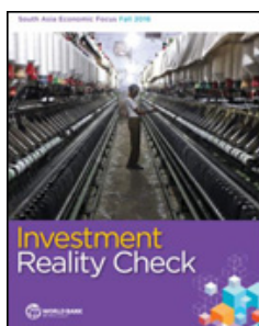
South Asia Economic Focus: Investment Reality Check