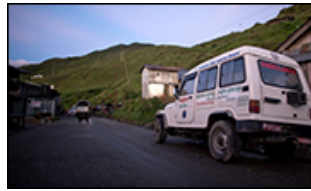
PROJECT SASEC ROAD IMPROVEMENT TO BOOST CONNECTIVITY