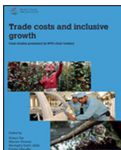
Trade Costs and Inclusive Growth: Case Studies Presented by WTO Chair-holders