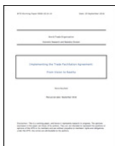
Implementing the Trade Facilitation Agreement: From Vision to Reality