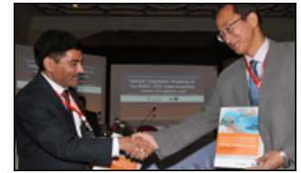
PROJECT SASEC OPERATIONAL PLAN LAUNCHED IN NEPAL