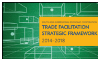
SASEC TRADE FACILITATION STRATEGY