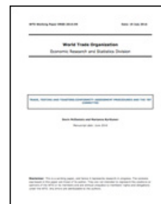
Conformity Assessment Procedures and the TBT Committee