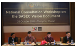
EVENT SASEC VISION DOCUMENT NATIONAL WORKSHOP