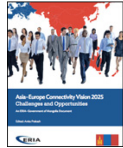
Asia-Europe Connectivity Vision 2025: Challenges and Opportunities