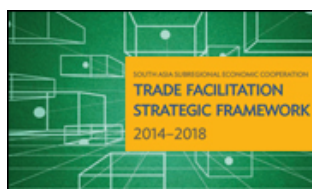
SASEC TRADE FACILITATION STRATEGY