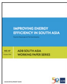
Improving Energy Efficiency in South Asia