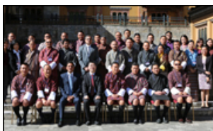
EVENT SASEC VISION DOCUMENT NATIONAL WORKSHOP