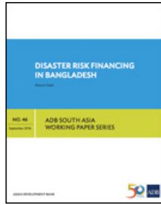
Disaster Risk Financing in Bangladesh