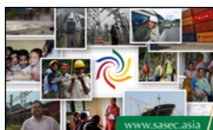
SASEC WEBSITE BROCHURE