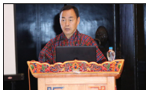
EVENT SASEC VISION DOCUMENT NATIONAL WORKSHOP