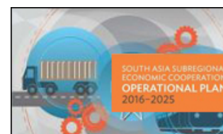
SASEC OPERATIONAL PLAN 2016-2025