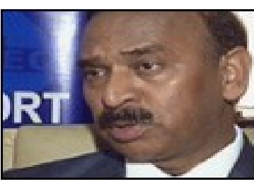
Customs-free borders for Bangladesh, Bhutan, India, and Nepal will save time and money for importers and exporters and thereby increase the ease of doing business, according to the Federation of Indian Exporters Organisation (FIEO). Because goods no longer have to be unloaded at the border, trucks can easily cross borders, reducing time and logistics costs for both buyer and seller.